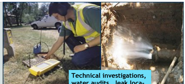
Technical investigations, water audits, leak location and repair services

CHALLENGES / SOLUTIONS: Locating leaks on underground pipes requires skill and dedication. Locating the leak is undertaken by acoustic sounding and line tracing. The final pin-pointing is achieved by sophisticated leak noise correlation techniques. Careful excavation is required to avoid damage to other utility services when effecting a final repair and reinstatement.